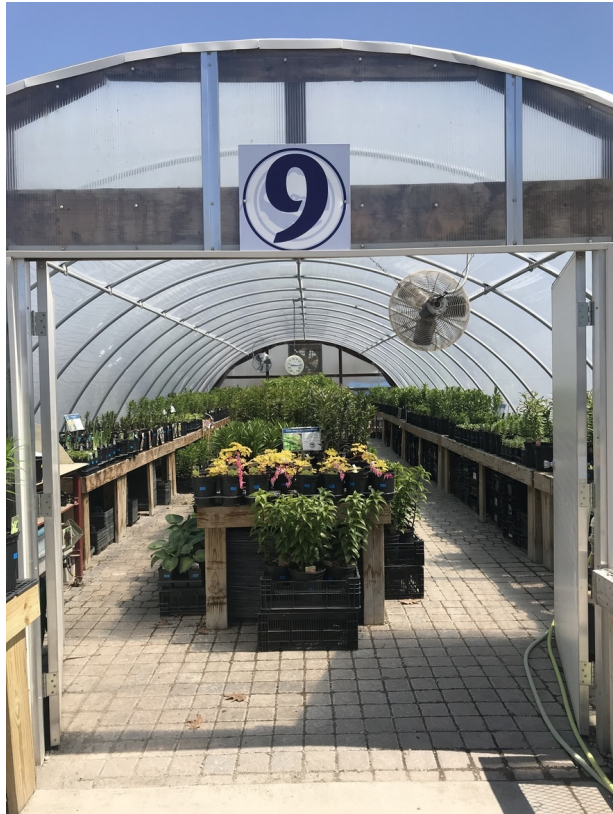
Greenhouse 9 is home to our perennial Lilies! Scoop them up before they are gone.

Sale voids tree and shrub guarantee policy.