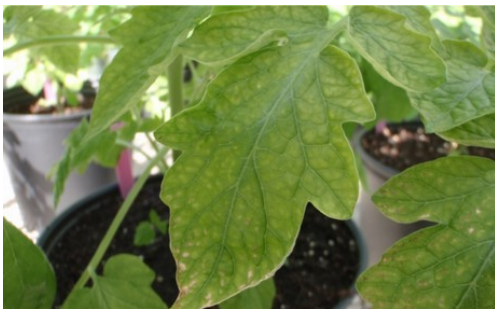
The beginning stage of Chlorosis on tomatoes.