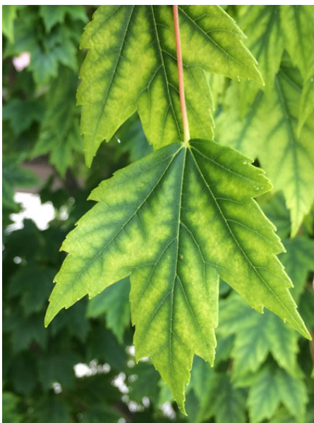
Red Maple chlorosis