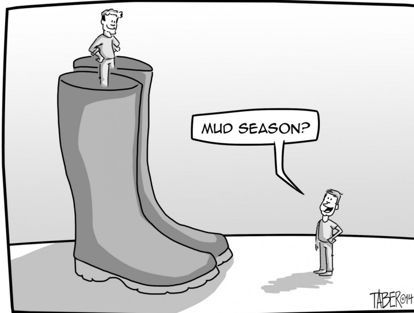
I think we can all agree we are currently in mud season.