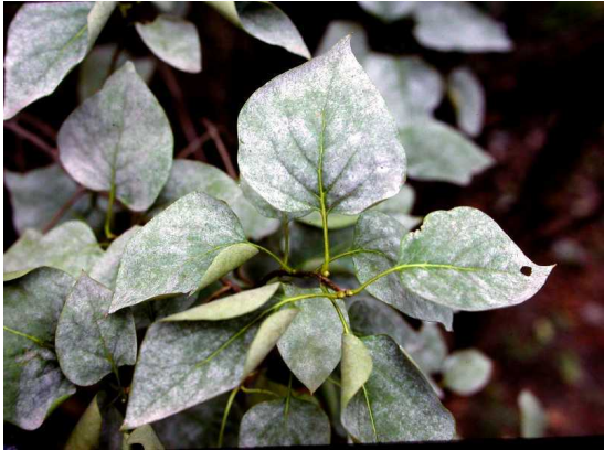
Powdery Mildew on Lilac