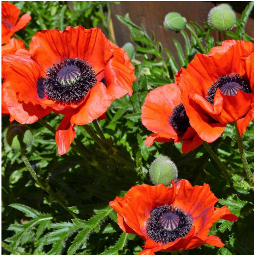
'Prince of Orange'

Too much shade and their blooming will be limited.