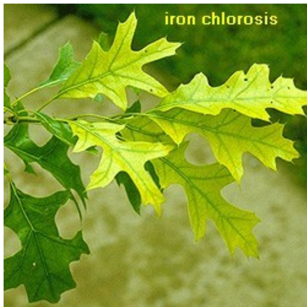
Pin Oak chlorosis